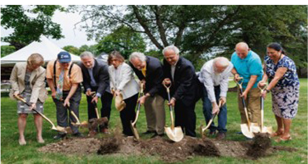
Breaking ground for the SUNY Broome Time Capsule