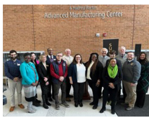
SUNY Broome Press Conference announcing a new class for training future lines persons for NYSEG